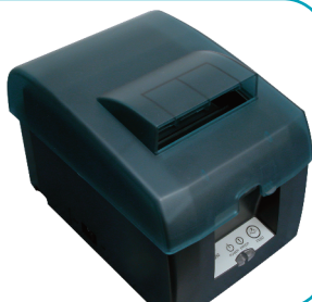
Optional Splash Proof Cover