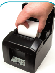
Easy Drop-In & Print