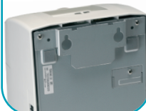
Vertical Wall Mount