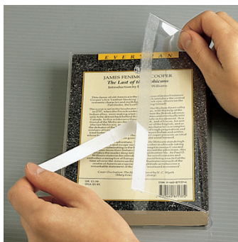
(4) Pull back white liner and press down on pressure-sensitive adhesive strip to seal together.