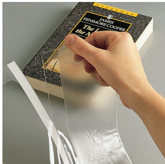
(1) At scored line, separate into two pieces by gently pulling apart.