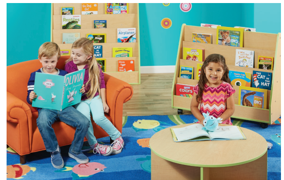
Kidovation® furniture fits kids and includes literacy-building elements in its design.