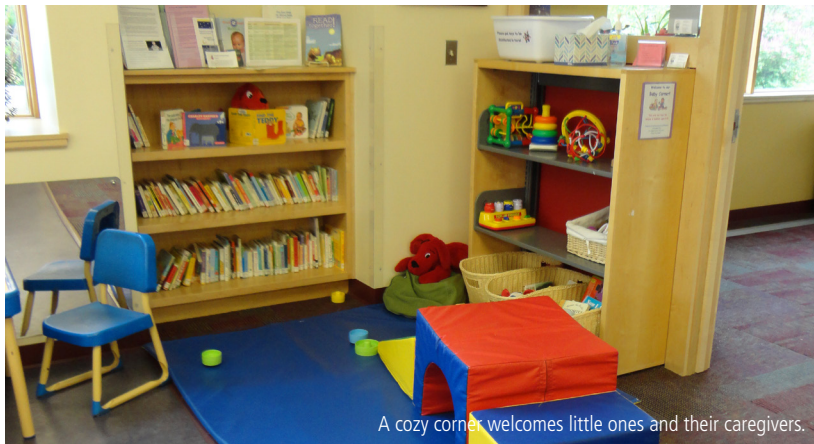
A cozy corner welcomes little ones and their caregivers.