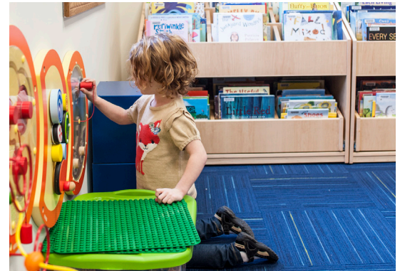
Joshua Hyde Public Library, MA Play and browsing unite. The collection is accessible in face-out ColorScape® book browsers.